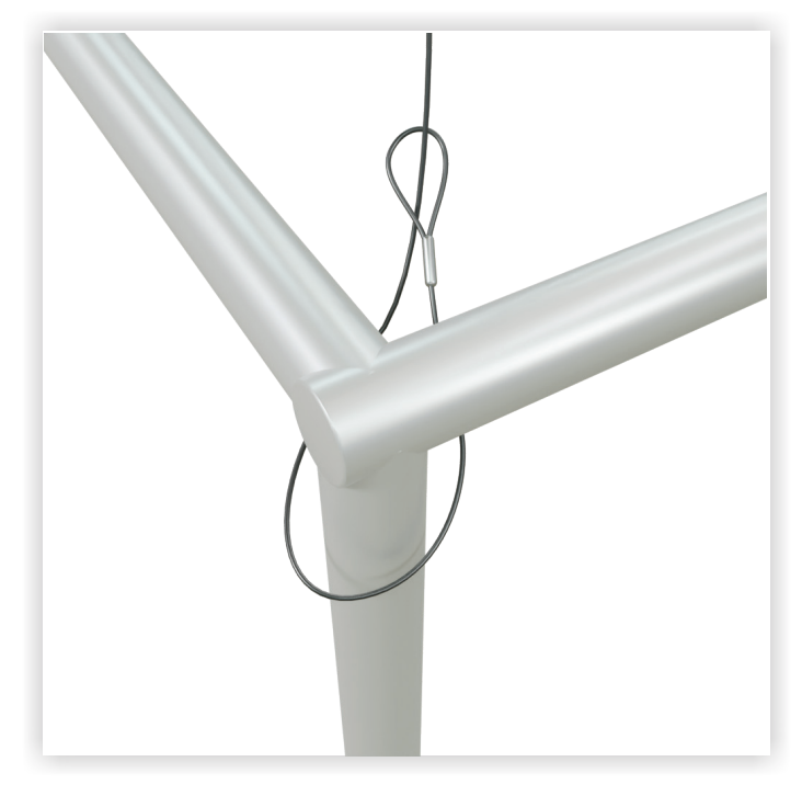
Step 2 Open the zippers to expose the hanging area, then wrap the cables around the vertical support pole