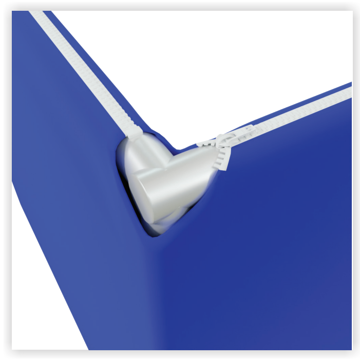
Step 1 After assembling the sign, locate the hanging points. There are openings on the zipper to allow for cables to be inserted