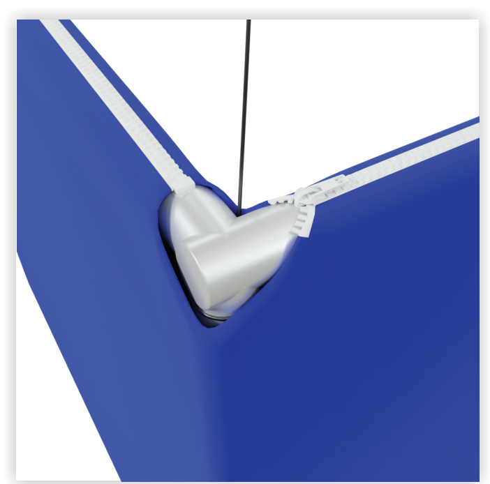
Step 3 Pull the cable through the opening in the fabric. Close the zippers.