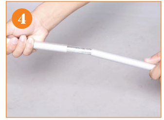
4. Connect the 4 section pole.