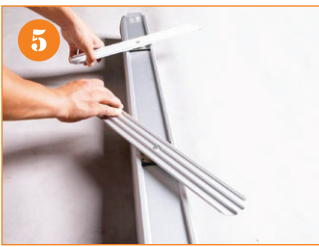
5. Turn both feet sideways to secure the base.