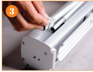
3. Take out the pole from the base.