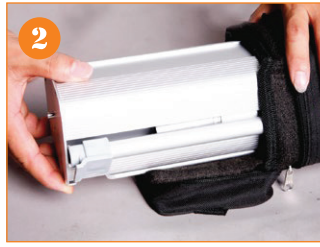
2. Take out the base from the bag.