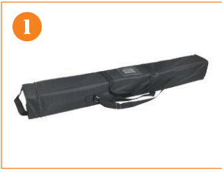
1. Black padded bag.